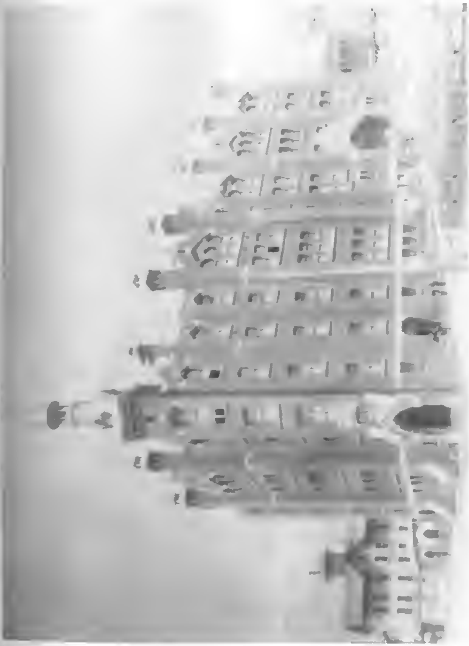
The Cooper Medical College, 1883